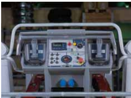
All driving and boom functions are operated from the well-designed panel.