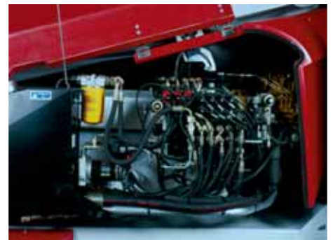
Maintenance of the modern and reliable hydraulic & control systems is easy.

DINO® and Dino Lift® are trademarks registered by the company Dino Lift Oy