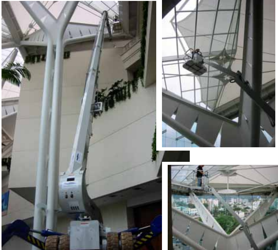
Hawaii Convention Centre